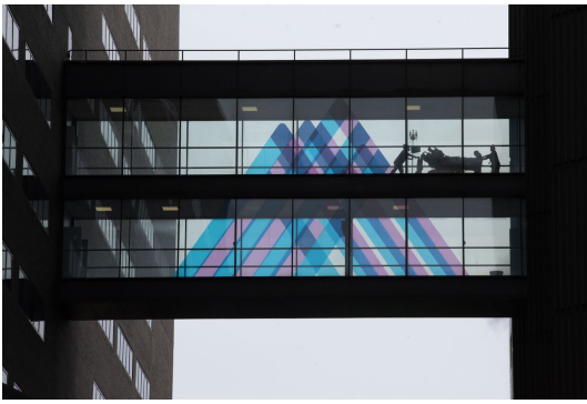
Medical personnel wheel a patient over a passageway in New York's Mount Sinai Hospital.